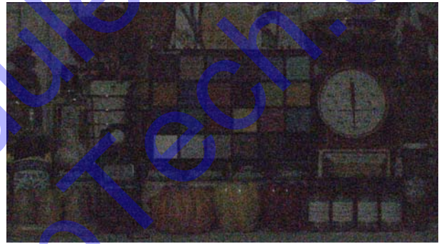
New product IMX323LQN Gain 45 dB