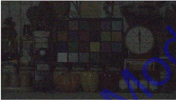
Existing product IMX222LQJ Gain 42 dB

Conditions: 0.1 lx, F1.4 (ADC 12 bit mode, 30 frame/s)